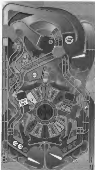
TABLE 3 • BILLION DOLLAR GAMESHOW