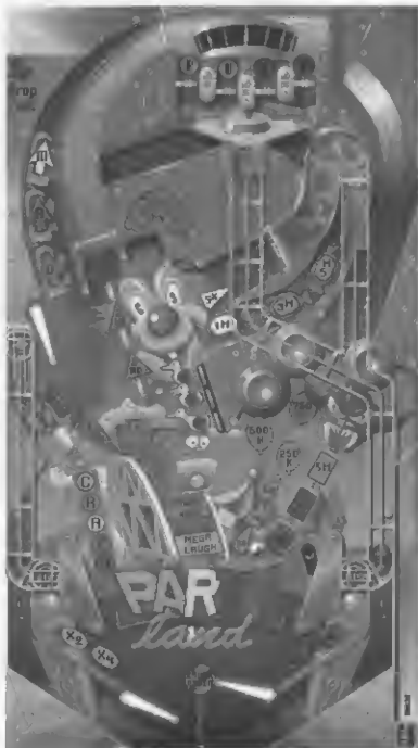
TABLE 1 • PARTYLAND